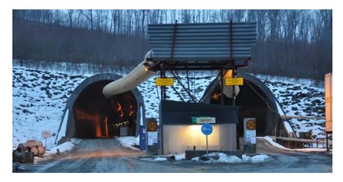
Figure 1. The Hallandsås tunnel during construction.

ingress was also substantial and exceeded soon the allowed thresholds by far. The first contractor, Kraftbyggarna, was unable to complete the tunnel under such conditions and went into bankruptcy, making the construction works to come to a halt.