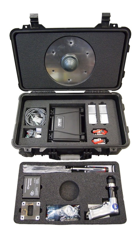
Figure 1. NMAS for Wärtsilä

if needed. Remote control of the measurement settings was required to be able to adapt to variable engine operation conditions without stopping the engine.